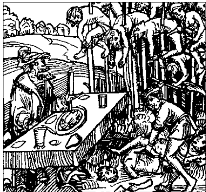
Vlad Tepes "Dracula" enjoying a feast at a mass impalement.